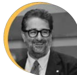
Vincenzo Calvanese Archaeological Park of Pompeii/ Italy