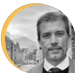
Gabriel Zuchtriegel Archaeological Park of Pompeii/ Italy