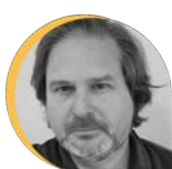
Raffaele Martinelli Archaeological Park of Pompeii / Italy