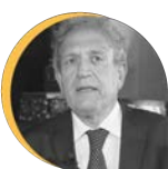
Fabio Fatuzzo Commissioner for Wastewater Treatment and Reuse / Italy